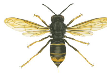
Yellow-legged (Asian) hornet Vespa velutina