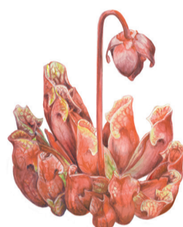
Purple pitcher plant Sarracenia purpurea