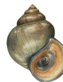
Chinese mystery snail Cipangopaludina chinensis