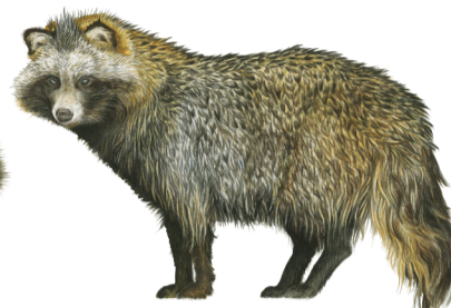
Raccoon dog Nyctereutes procyonoides