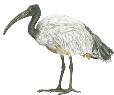
Sacred ibis Threskiornis aethiopicus