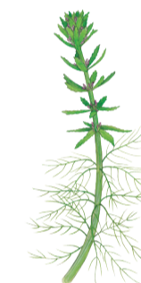
Broadleaf watermilfoil Myriophyllum heterophyllum