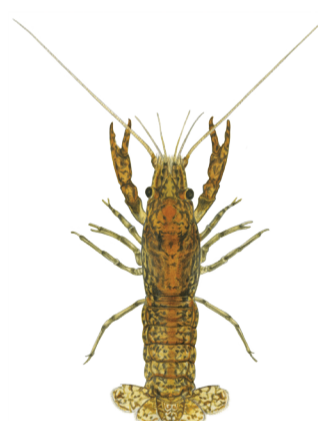
Marbled crayfish Procambarus fallax f. virginalis