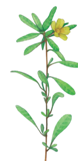
Water primrose Ludwigia grandiflora