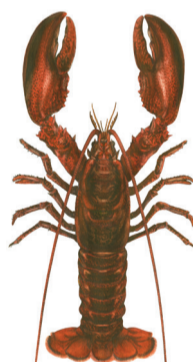
American lobster Homarus americanus