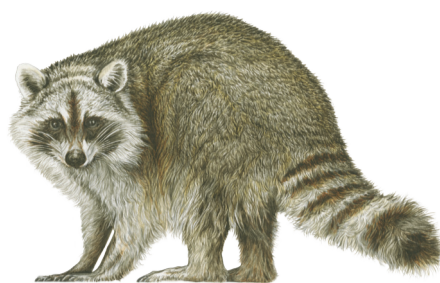
Raccoon Procyon lotor