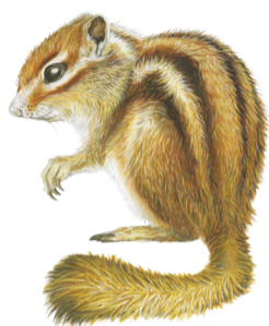
Siberian chipmunk Tamias sibiricus