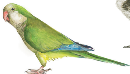
Monk parakeet Myiopsitta monachus