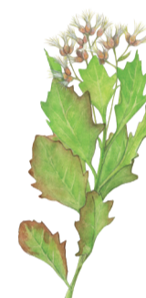
Eastern baccharis Baccharis halimifolia