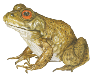
American bullfrog Lithobates catesbeianus