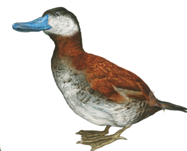
Ruddy duck Oxyura jamaicensis