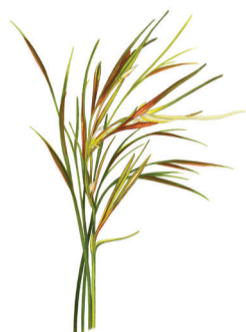
Chilean needle-grass Nassella neesiana