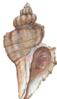
Japanese sting winkle Ocenebrellus inornatus