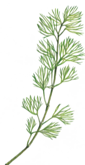
Carolina fanwort Cabomba caroliniana