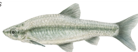
Topmouth gudgeon Pseudorasbora parva